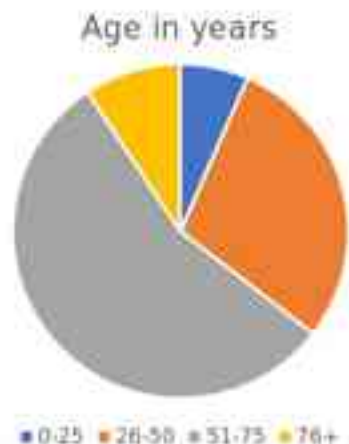
Figure 1. Patient Age distribution