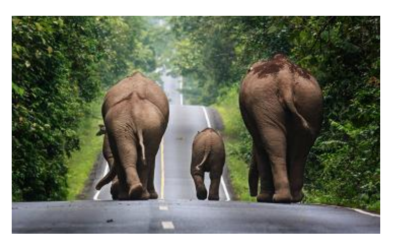
Elephants of Thailand

https://www.axios.com/timeline-the-early-days-of-chinas-coronavirus-outbreak-and-cover-up-ee65211a-afb6-4641-97b8-353718a5faab.html